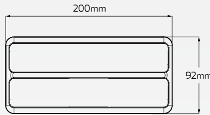
Left hand side