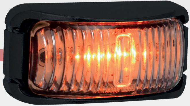
Clear lens when not illuminated