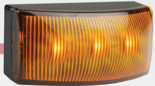
Amber coloured lens