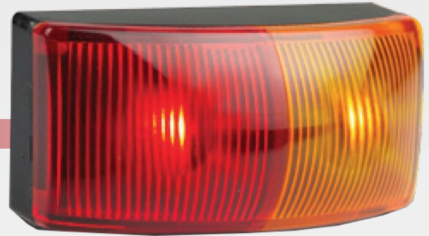
Red & amber coloured lens