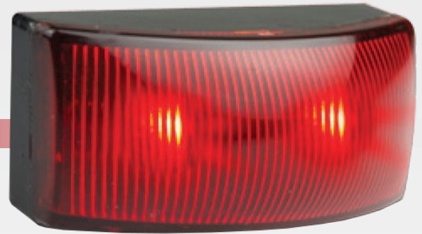
Red coloured lens