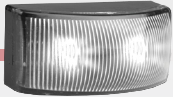
Clear coloured lens