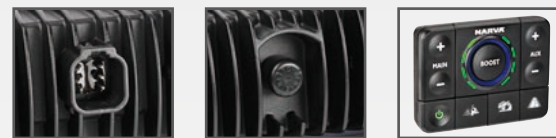
Built-in DT4 Connector