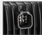
Built-in DT4 Connector