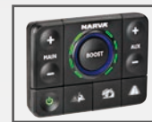
Ultima Connect + Compatible (optional)