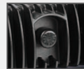
Nitto Breather Vent