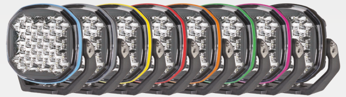
EX2 range comes with customisation option at no extra charge. Redeemable via QR code online!

Features an extensive customization options of 8 trim colours, redeemable online free of charge! Includes 7 year manufacturer warranty.