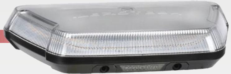
Clear lens when not illuminated