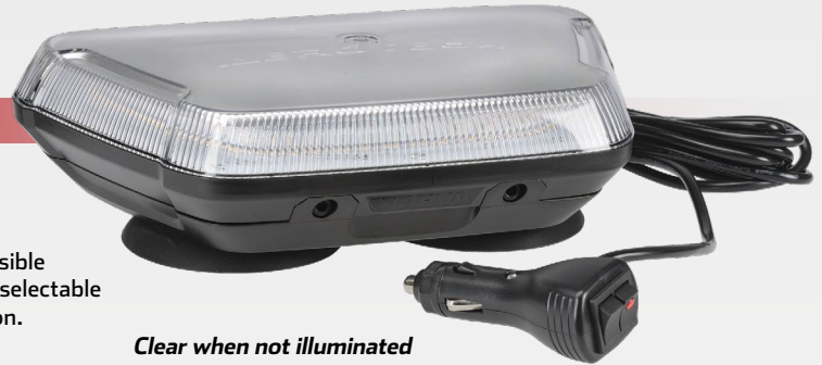
Clear when not illuminated

Comes with 7 year manufacturer warranty.