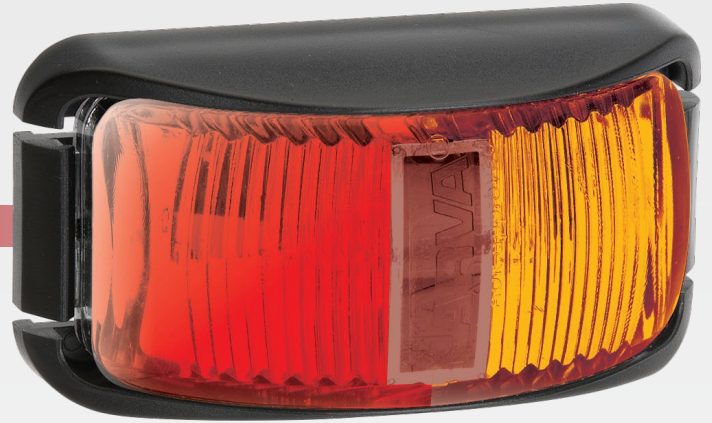
Clear lens when not illuminated