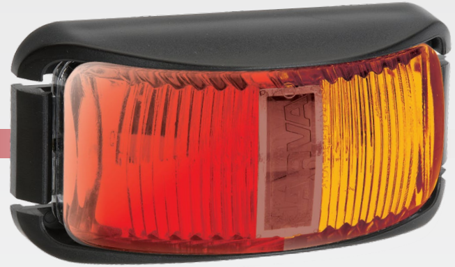
Clear lens when not illuminated