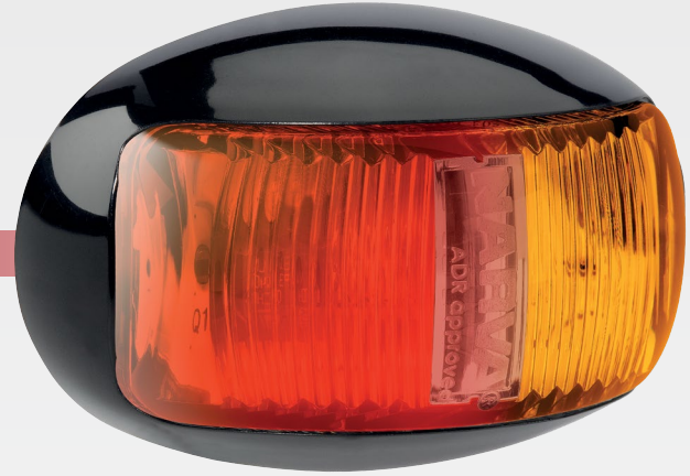
Clear lens when not illuminated