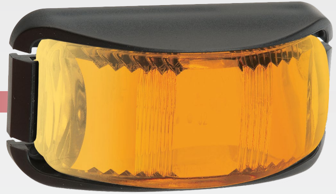
Clear lens when not illuminated

5 year manufacturer warranty. Blister packed.