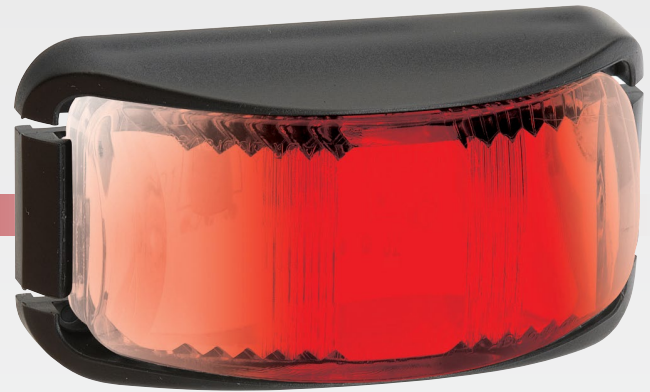
Clear lens when not illuminated