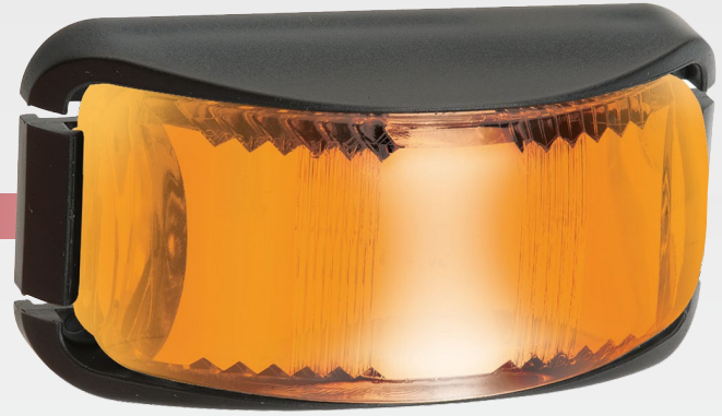
Clear lens when not illuminated