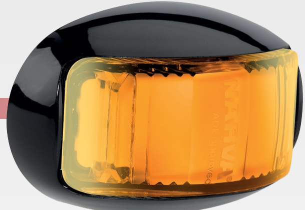
Clear lens when not illuminated