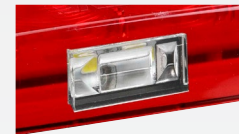
Optional license plate lamp PN - 93434BL & 93436BL