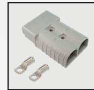
50 Amp Anderson connector and 8mm eyelet terminals