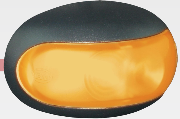
Clear lens when not illuminated.