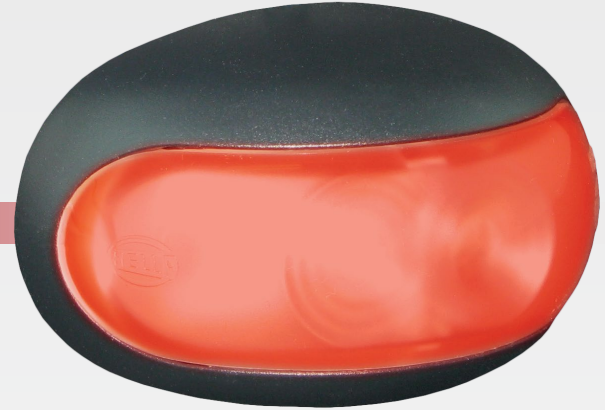
Clear lens when not illuminated.