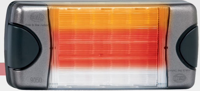
Clear lens when not illuminated