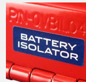
Powder coated for easy identification