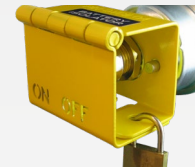
Securely locked in the OFF position