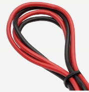
Comes with pre-wired twin core cable