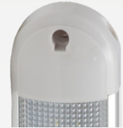
Easy to mount