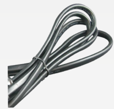
Heavy duty 16AWG cable