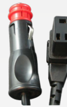
3 Pin DC power output