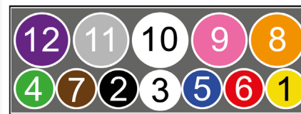
Plug cable entry view. Based on standard 12 pin wiring system