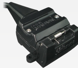
Pre-wired with a Narva 12 pin flat trailer socket