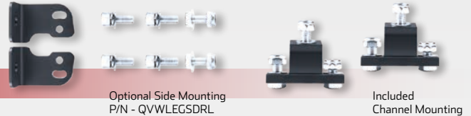
Optional Side Mounting P/N - QVWLEGS DRL