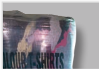
Compressed for easy storage