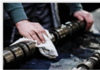
Suitable for Wiping, Polishing & Dusting