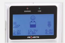
Low Voltage Disconnect