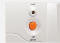
Manual Load Control