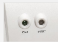
LED status indicator